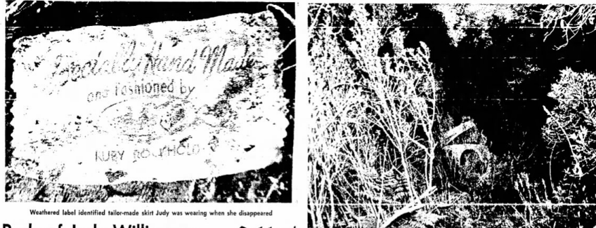
Weathered label identified tailor-made skirt Judy was wearing when she disappeared