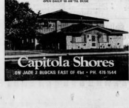
Capitola Shores ON JUNE 2 BUCKS EAST OF 4th - PH. 476-1544

More than 300 of these lovely two Bedroom homes have been sold. Just a few remain. This is a perfect home location, just a couple blocks from the beach. All yardwork and outside maintenance is done for you. Hundreds of satisfied buyers have already bought here. Don't wait, the last ones are going fast. Total Price $16,500. FHA financing available.